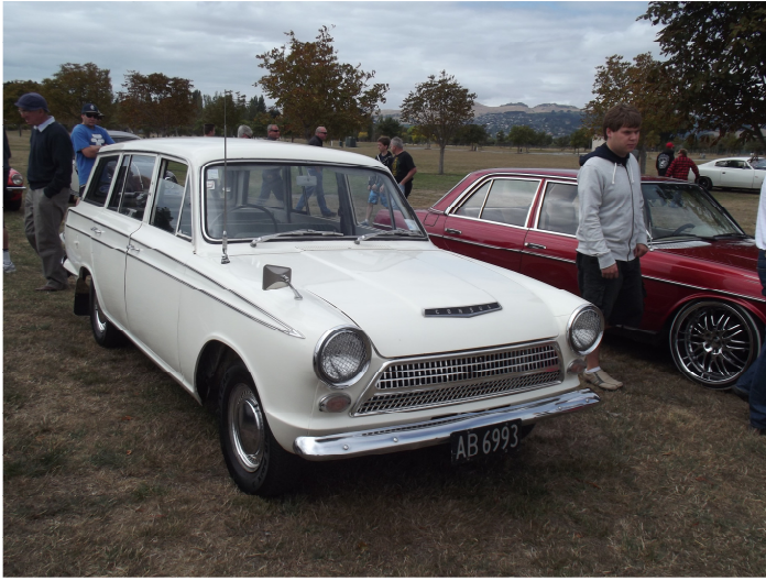
A great example of the cars at the Twin River Event

Several members attended this event. The organisers allowed us to be together as a group –this gave us the opportunity to canvass for some new members. A really great selection of cars to be seen.